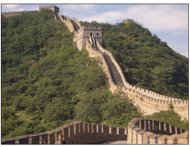
The Great Wall of China.

First of all, China is a The reason that I moved very big and enjoyable When I first got to from place to place, due to Finland, Norway, America, Forbidden Palace. China, I thought everyone its immensely high popula- Turkey, Germany, and much there would be speaking a tion. But since the size of more. My favorite place in living in China, and I think really awkward language the country is so big, it is China was my house many other people would and doing weird things, but easy to go from place to because it was really big, enjoy living there, too.